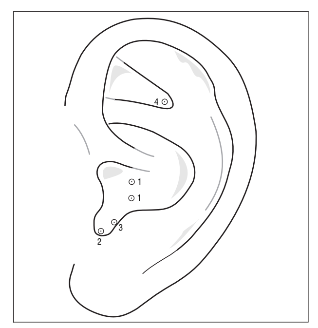
Figure 2. Illustration of 4 common points of auricular acupuncture prescribed for chronic urticaria. 1 indicates the lung point; 2, the endocrine point; 3, the subcortex point; and 4, the shenmen point.

Initially, ordinary acupuncture has been tried for the treatment of chronic urticaria. In addition to the common 4 acupuncture points described in Figure 1, other acupuncture points, such as LI4 (Hegu), B40 (Weizhong),